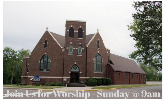
Join Us for Worship - Sunday @ 9am

Don't forget to join us online each Sunday via the website or FB@FLCBarron or in-person