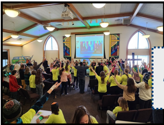
"Christ Jam" Middle School Youth Gathering 2023